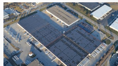
Duke Solar Project Building #98 - Indianapolis, IN