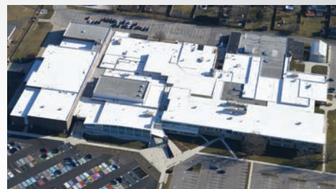
Lebanon High School - Lebanon, IN

Studies have shown that a roof that is not regularly maintained will only last about half of its expected service life. Most warranties are void if you cannot provide proof the roof has been maintained. Let Danco Roofing Services, Inc. provide you the service you need to ensure your warranty remains active..