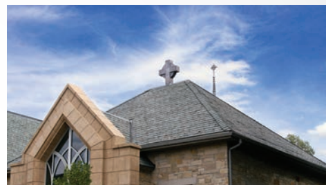
Immaculate Heart of Mary Church - Indianapolis, IN