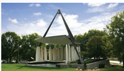
Slayter Center of Performing Arts - West Lafayette, IN