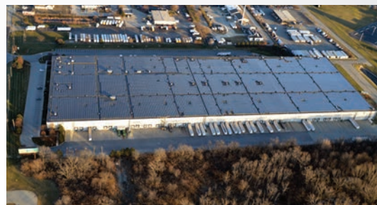
Duke Solar Project Building #129 - Indianapolis, IN

Danco Roofing Services, Inc. is a leader in new roofing technology and materials. We utilize the most current installation methods and have state of the art estimating and client tracking tools. We provide our clients with an on-line portal which allows them instant access to project updates, photos and completion status.