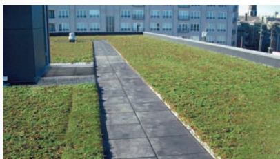
The Nature Conservancy - Indianapolis, IN