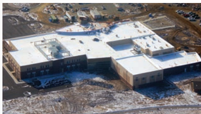
Hendrick's Regional Health / YMCA - Plainfield, IN