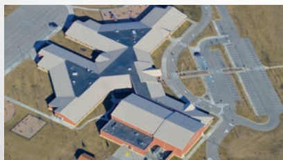
Promise Road Elementary School - Noblesville, IN

Since 2015 Danco Roofing Services, Inc. has also been awarded the FIRESTONE INNER CIRCLE OF QUALITY "Q" AWARD for maintaining over 6 million square feet of warranted roof systems with zero defects.